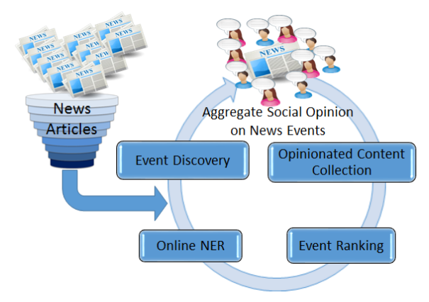
Figure 1: Information flow and main components of FLORIN

Proceedings of the VLDB Endowment, Vol. 8, No. 12 Copyright 2015 VLDB Endowment 2150-8097/15/08.